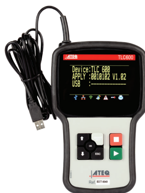
TLC 600 Remote control